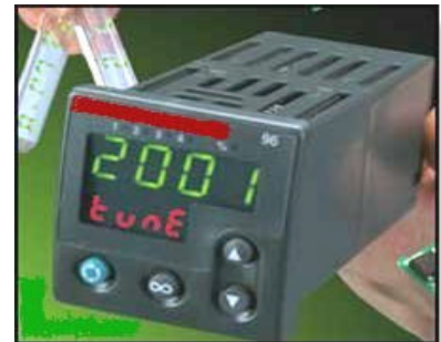
New Electronic Concentration Controller