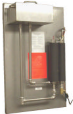
Boiling Point Analyzer

Continue to benefit from maintaining precise automatic concentration control. Replace your older obsolete BPA concentration controller with a new Niagara electronic concentration controller with digital display.