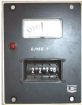
Older Concentration Controllers