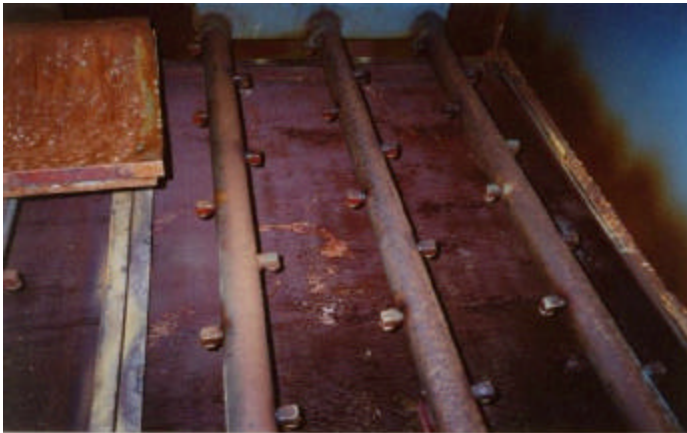
Leaking ammonia coil from a system using an “off-brand” glycol liquid in their No-Frost o system.

How much do you save when you choose a “Bargain Fluid” for your Niagara No-Frost o system? Not enough to purchase one replacement coil!