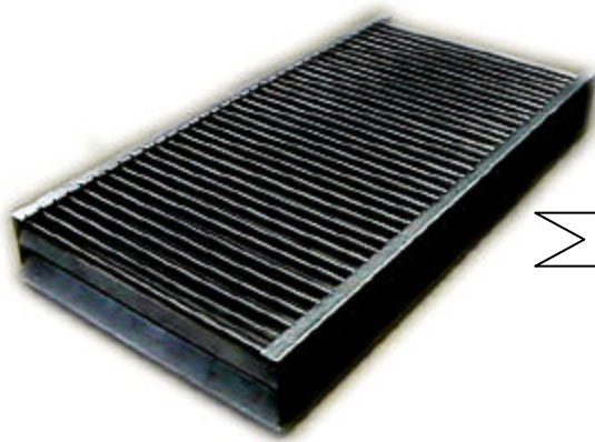
Older Metal Drift Eliminator

In addition, the lightweight design allows easy removal for inspection, cleaning or replacement. The new eliminator is a factory-stocked item for most models.